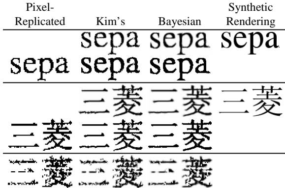
Fig. 3. Selected Results: These are small clippings from three tests. We used Kim’s method and our Bayesian method for super-resolution, with 5 \times 5 low-res patches and non-overlapping 2 \times 2 high-res patches. The input to the first two rows is from an English document, using 12pt. Times New Roman, scanned in at 200dpi. The next two rows are from a Japanese (Kanji) document, using 12pt. SimSun, also scanned at 200dpi. The final row is the same as the previous pair, except the data were generated by rendering the image with synthetic noise and the Bitstream Cyberbit typeface was used. The bilevel images (2 nd and 4 th rows) were created by manually selecting a threshold on the corresponding grayscale images.

most likely t by thresholding L . We then recursively flip individual pixel values in t until P(t|L = l) \approx 0 . If we only allow up to n pixels to be flipped (with respect to the most likely t ), our worst-case time complexity reduces to O(|L|C_n \cdot |H|) per training sample.