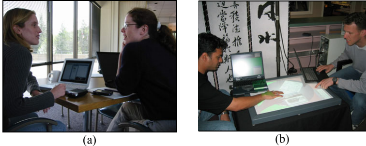
Fig. 1. (a) Collaboration at an airport (reproduced from [4]) (b) Collaboration around an UbiTable

The goal of the UbiTable project is to provide efficient walk-up setup and fluid UI interaction support on horizontal surfaces. We wish to enable spontaneous, unplanned, collaboration where the participants share contents from their mobile devices such as laptops and PDAs. We draw technological underpinnings from peer-to-peer systems [4], ad hoc network protocols (such as 802.11 ad hoc mode, or Bluetooth), and existing authentication and encryption methods. Our focus is on design solutions for the key issues of (1) a model of association and interaction between the mobile device, e.g., the laptop and the tabletop, and (2) the provision of three specific shades of sharing semantics termed Private , Personal and Public . This is a departure from most multi-user systems where privacy is equated with invisibility. Figure 1 (b) shows the current UbiTable setup. Note that UbiTable also provides a variety of digital document manipulation functions, including document duplication, markup, editing, digital ink for drawing and annotation. The elaboration of these functionalities is out of the scope of this paper.