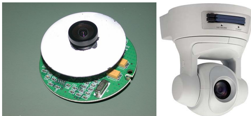
Figure 2: Left: camera designed for flush mounting on surface. Right: a pan-tilt-zoom camera system.

to invade the privacy of a building occupant in some way. the threat is even smaller, since the threat of inferring identity from pattern analysis is likely to be out of reach of an adversary with limited resources.