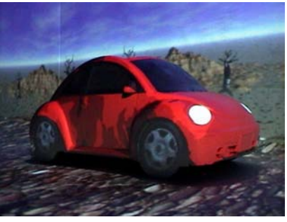
Figure 1: (Top-left) The diorama of a car and approximate background. (Bottom) A cartoon-like environment created by image projection in which the car appears to move (Top-right) A night-time simulation using virtual headlights.