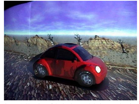
Figure 5: Shearing of the background during acceleration.

A setup to introduce non-realistic appearance and motion can be used for many other applications. Some examples are educational