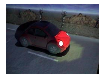
Figure 4: Shading due to street lights as spot lights.

brown sharp edge in Figure 2(i)) does not correspond to the projection of the boundary between the backdrop and ground. Hence, first we need to eliminate any sharp edges that the user may be able to use as a frame of reference. A conflicting cue affects the perception of vertical component of the motion. Second, we need to represent the surface with the approximate average of corresponding variation in the geometry. The solution is to the smooth the edge using a paper with small curvature (see brown lines in Figure 2(ii), (iii)).