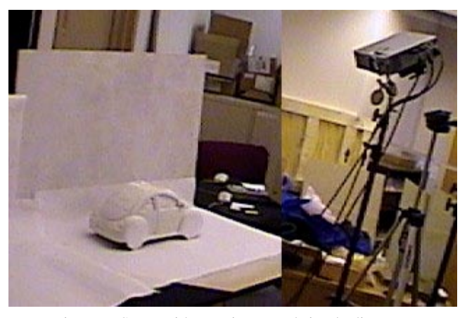
Figure 6: Setup with a projector and simple diorama.

Currently we use a Mitsubishi X80U LCD projector, 1000 lumen, 1024x768 resolution. The toy-car (Barbie Beetle, bought at a toystore) is 50cm x 25cm x 20cm (Figure 6). The 3D model is generated from multiple photographs using PhotoModelerPro and then authored in 3DSMax. The model is very coarse, 602 triangles. We struggled with creating smoothly varying normals across the car surface, resulting in shading artifacts. A better 3D scanning method should overcome those problems. The animations are rendered at approx. 15-20 fps. To determine projector pose during calibration, we used 15 pairs of predetermined 3D points on the car surface and the corresponding projector pixels that illuminate them. The projectors pixels are interactively found by projecting a cross-hair and moving the mouse till the cross-hair lines up with one of the 3D feature point. This process takes only two minutes. The resulting re-projection error is less than one pixel allowing near-perfect static registration. To find the axis of rotation of the turn table, a second set of projector pixels for the same 3D points, after angular displacement, is used.