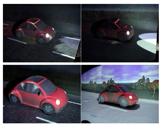
Figure 7: Photo-realistic diorama (left column) vs. cartoon diorama (right column). Note the headlight beams, specular appearance and textures.

We do not have systematic user experience data but the system has been seen by over two thousand people. The working system has been demonstrated to visitors of the lab, at an art show, during UIST'01 conference, and to dozens of Disney researchers in Orlando, Florida. Most users get excited at the following stages: (i) when the car starts, (ii) when the car motion switches to bumpy motion, (iii) when the car is rotated on the turn table while maintaining its augmented surface appearance. As mentioned earlier, the effect is most noticeable during any changes in apparent motion and it lasts for a short time. The human visual motion detection system quickly becomes balanced again. Hence, it is important to constantly change the motion parameters. The synchronized car engine (or brake) sound seems to have a huge impact, it generates anticipation before the car starts and reinforces the notion of a car movement (as opposed to movement of the background). We implemented a photo-realistic version as well as the cartoon-like version (Figure 7). The cartoon-like version appeals more when the car is in motion. Viewers, not familiar with the technique, are unimpressed to see the static cartoon version. This is probably because we are all used to looking at much higher quality cartoon-like setups. But, the