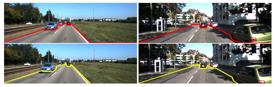
Figure 4. On the top, we show the ground-truth free-space curve in image I_{t-1} . Using the estimated homography, we show the free-space curve on the next image I_t under only the homography transform.

curve as we typically have too many spurious correspondences on water. Note that the edges from reflections of objects on water will not match using the homography matrix, and thus we can filter them from our curve. In the case of road scenes, we use the SIFT matches below the previous free space curve to compute the homography matrix, as refections are not a problem.