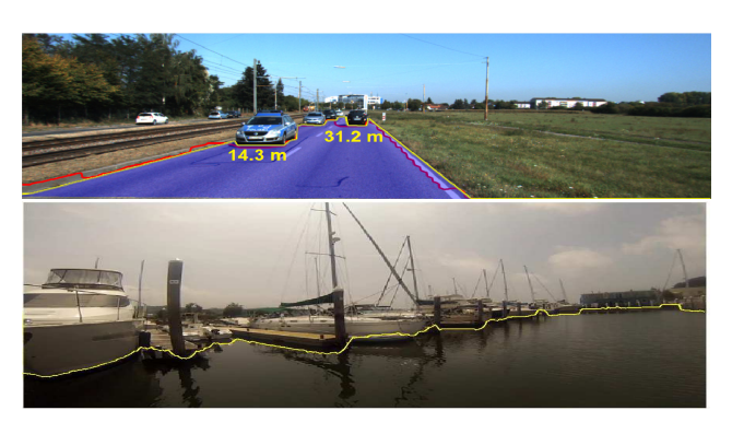
Figure 1. (Top row) An image captured from the front of a car while driving on a road. The red curve shows the ground truth free space where the car can move without colliding with other cars and obstacles. The yellow curve shows the free space estimated using our algorithm. The blue marked region is the ground truth road classification. The numbers indicate the 3D distance from the camera to the obstacle estimated by our approach. (Bottom row) An image captured from a boat. The single yellow curve represents the free space where our result and the ground truth coincide visually.

A common assumption has been that if we are able to develop robust and accurate solutions to these problems, we should be able to solve autonomous navigation relying