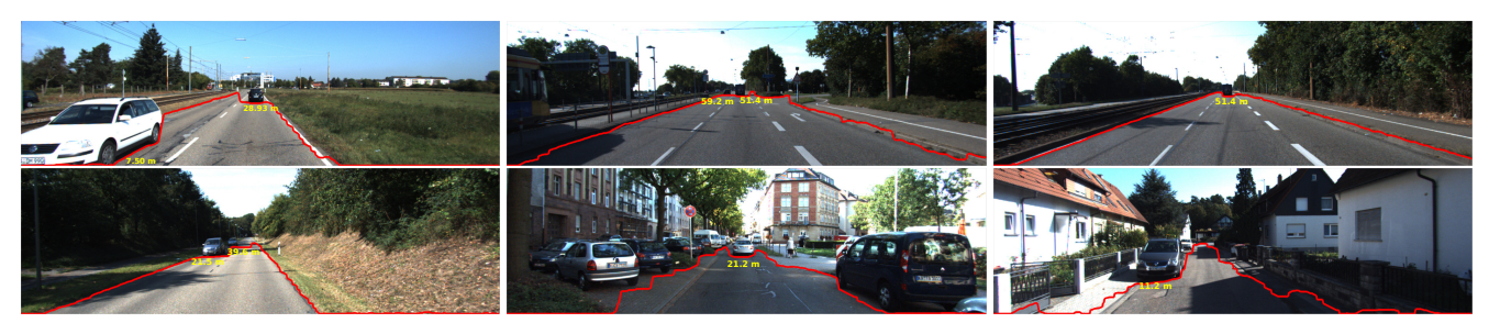
Figure 5. The red curve is the result from our model. When the parameters of the camera are known, we can estimate the distance from the obstacle to the camera (yellow text).