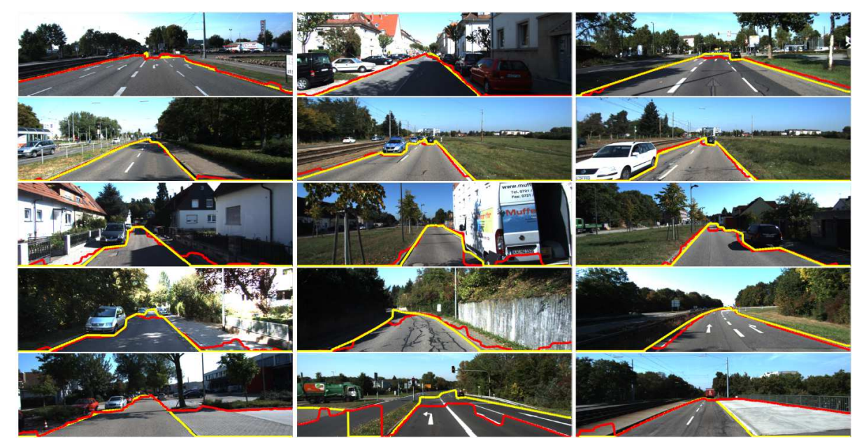
Figure 7. Example results from KITTI road dataset. The top four rows show some of the best performing scenes, demonstrating accurate results given by our approach. The last row shows worst performing scenes; failure modes are typically due to road markings and confusion between pavement and road.