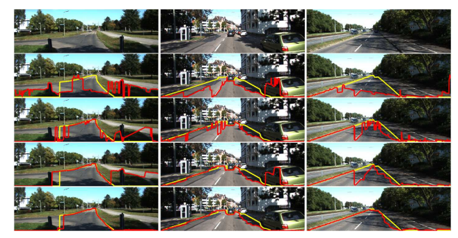
Figure 6. The evolution of the free space curve as we use more and more features. The yellow curve is the ground truth and the red curve is our result. (First row) Original images. (Second row) Edge. (Third row) Appearance. (Fourth row) Edge + Appearance. (Fifth row) Edge + Appearance + Homography. All the results use the smoothness term.