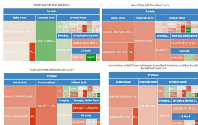
Figure 1: A set of classic treemaps from finance. The variable “Value” maps to area in all 4 cases; a different variable maps to color in each case. (Courtesy of Google Sheets.)

themselves to multivariate visualization is that the rectangles at the leaves of the hierarchical trees are of varying widths and heights. Color is invariant to the aspect ratio of the containing rectangles, so color provides a natural mapping for one variable. Patterned fills have sometimes provided a second mapping. However, further regularization is needed for comparison across elements [3]. Researchers have proposed to regularize the shapes and positions of cells at the leaves of treemaps [1][8] and also insert 2D charts in constant sized leaf cells [3]. However, we have not encountered in research or in practice the proposal to fix one dimension of the leaf rectangles to accommodate multiple fixed-height colorable canvases while varying the other dimension to accommodate the area mapping.